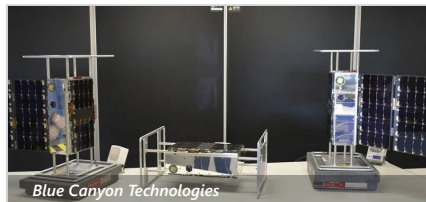
Blue Canyon Technologies