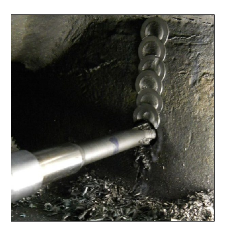
Figure 3: The QuantiServ Metal Stitching Process [14].

QuantiServ is a metal stitching company in Houston, TX, that provides case studies of larger pieces being repaired with locks and stitching pins. An example of the company's stitching is shown in Figure 3.