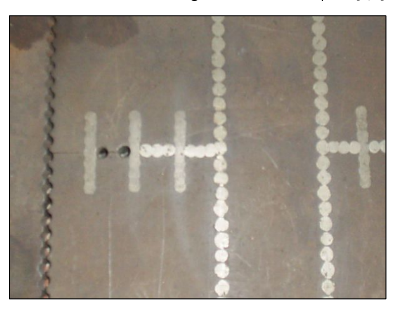
Figure 1: The Finished Metal Stitching Process [3].

The initial metal stitching process patent was awarded to Hal Harman in 1935; the process was developed to provide a permanent, stress-free repair for cast iron using little or no heat [1]. Metal stitching is performed by drilling holes at right angles to the fracture or crack and then converting them into a slot. Preformed locks or screws are then fitted into the slots to bridge the fracture. The locks are typically made of high-nickel steel with the same coefficient of expansion as the cast iron because it is strong enough to take shear loads, but sufficiently ductile to provide the necessary elasticity. Most repairs have a series of locks and stitches spaced at regular intervals along the crack. After the initial locks are set, holes are drilled along the line of the fracture between each stitch and tapped to receive special screws which fill the crack and ensure that it is completely watertight. The final step is to grind down the stitching to be flush with the original cast iron, as seen in Figure 1. Metal stitching doesn't cause distortions or thermal stresses that can result from welding or other heated repairs [2,3].