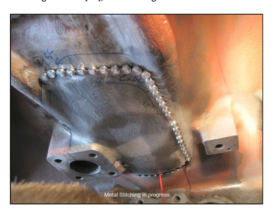
Figure 2: Metal Stitching Process to Repair a Damaged MaK 12M282 Engine Block [10].

Goltens in Miramar, FL, and Houston, TX, provides multiple case studies of metal stitching [9]. A particularly interesting case study describes the use of metal stitching to repair a badly damaged MaK 12M282 engine block [10], shown in Figure 2.